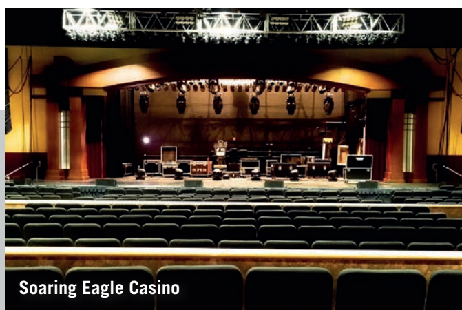
Soaring Eagle Casino