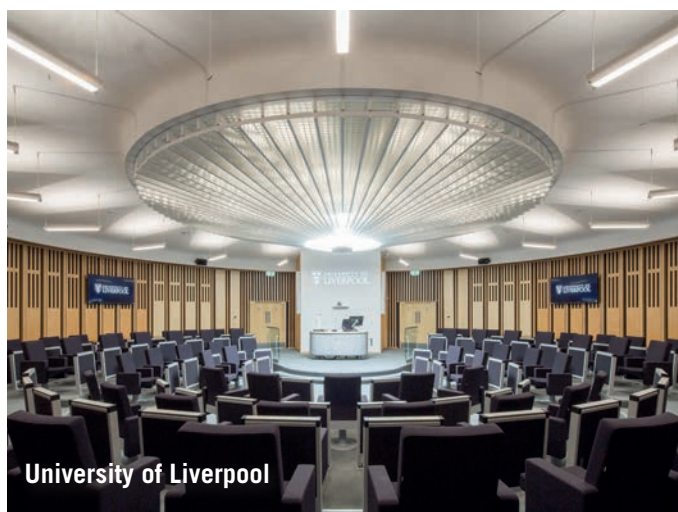
University of Liverpool

"We'd been in the market for a high quality, smaller format 8" speaker that produced high SPL and a very clear sound, which led to the purchase of 28 Martin Audio CDD-LIVE 8 speakers after a demo of the line. Our AV trade show clients need a speaker that's easy to hang and rig with a