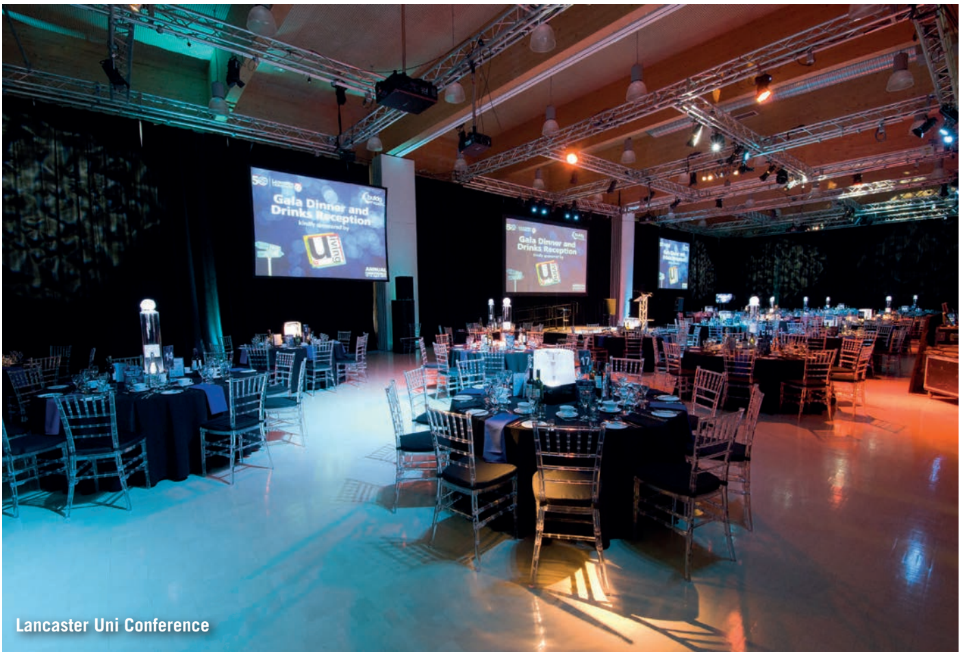
Lancaster Uni Conference