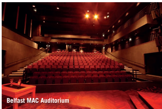
Belfast MAC Auditorium

BlacklineX is a classic suite of passive loudspeakers delivering our signature sound of warmth, nuance and clarity but at a remarkable price point. A clean, smart design suited to portable sound reinforcement and stage monitoring for corporate events, BlacklineX Series raises the performance of loudspeaker systems in its class to a new level.