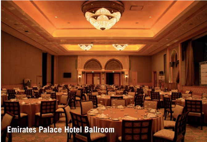
Emirates Palace Hotel Ballroom